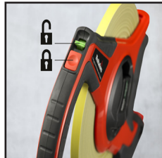
Press button blade lock