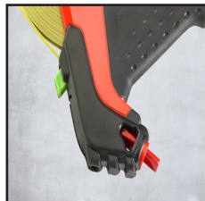
Advanced blade feed