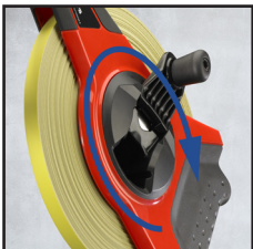
High performance rewind