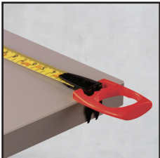
Triple action end-hook