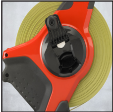
Right AND left handed rewind handles

Hultafors' new long tape, Surveyor, is developed with focus on ergonomic design. It has an ergonomic handle and smooth rewind, integral ground spike housed in the handle, and distinct buttons. As a result thereof it is easy to use and offers a high degree of precision.